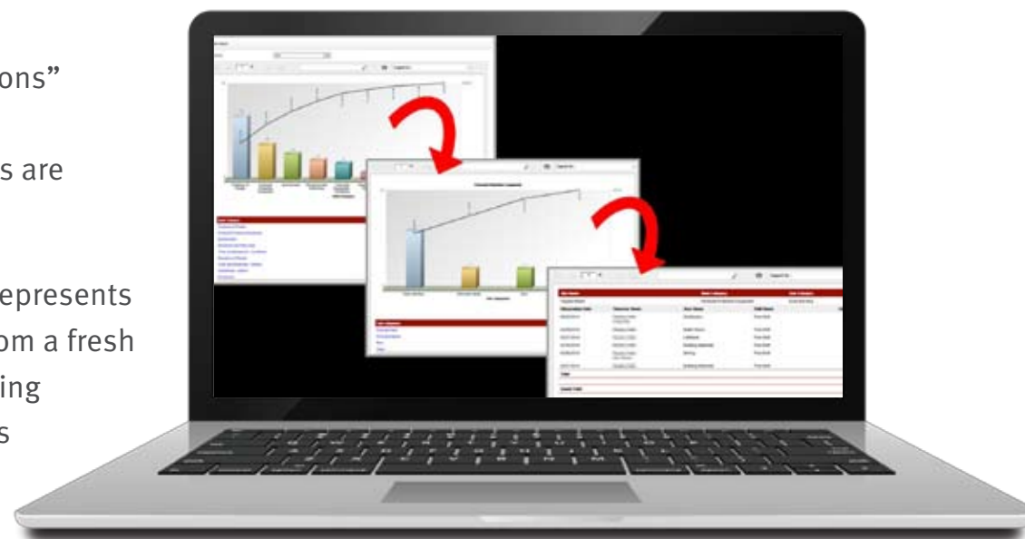
View a macro level report and drill down to the detail you need.